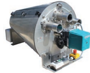
2/3-TDV Tube diverter

Versions conforming to EC 1935/2004 available