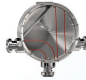
CIP-PTD Plug diverter CIP suitable