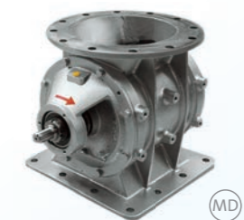
AML Airlock Extra large inlet