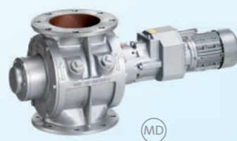
MALD Medium duty airlock