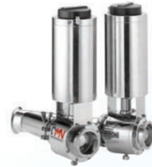
SBD Ball diverter Sanitary execution