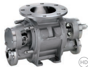
BL-BXL Blowing seal