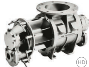
BL-BXL DAIRY Hygienic blowing seal USDA Dairy accepted