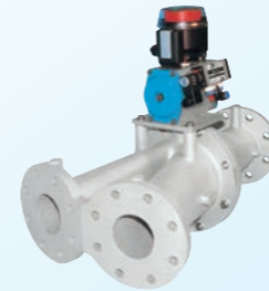
FDV Flap diverter