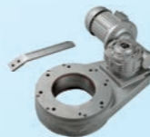
DUC Discharge unit