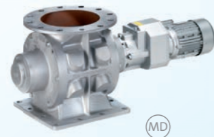
MLD Medium duty airlock