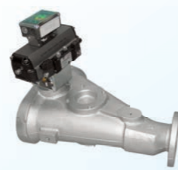
BTD Ball diverter For abrasive products