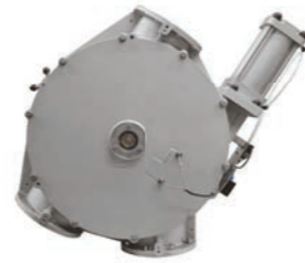
PTD Plug diverter Dual pipe