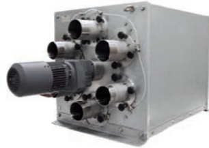
M-TDV Multi port diverter