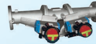
FVV Fill vent valve