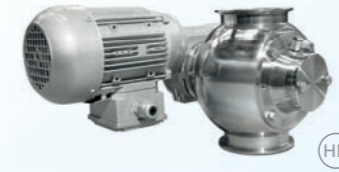
SAL Sanitary airlock