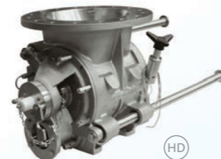
BL-BXL MZC Blowing seal with slide bars