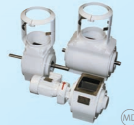
SRV Medium duty airlock