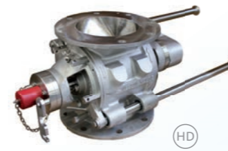
AL-AXL MZC Airlock with slide bars