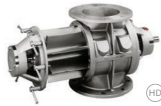
AL-AXL DAIRY Hygienic airlock USDA Dairy accepted