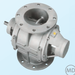
GL Granular airlock