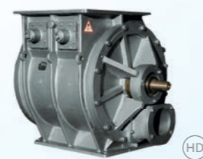
GOS High capacity blowing seal