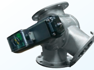
GPD Gravity plug diverter