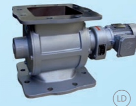
DL Dust lock