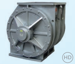
OS High capacity airlock