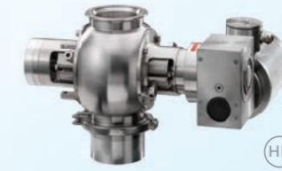
CIP ROTARY VALVE CIP suitable Drop through or blow through